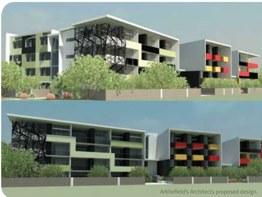
Arkhefield's Architects proposed design.

Following this approval, construction is expected to be completed by December 2010