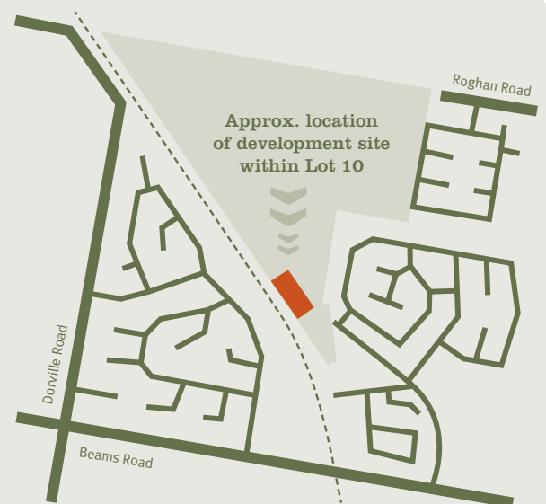
Where the BHC development will take place in Fitzgibbon Chase.

Details of the application can be viewed online at www.ulda.qld.gov.au or phone 3024 4166. Any person may, on or before 03-12-2009 make a signed written submission to the Urban Land Development Authority, GPO Box 2202, Brisbane Qld 4101.